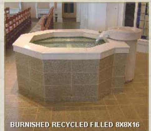
BURNISHED RECYCLED FILLED 8X8X16

Burnished Recycled Filled Units offer sustainable solutions for years of reliability and unmatched beauty. By exposing the variegated colors of the aggregate and then "filling" the pores with a cementitious grout, a unique terrazzo-like finish is produced. Providing unparalleled quality and durability, Burnished Recycled Filled Units also offer high thermal mass qualities by reducing heating and cooling costs which also benefits the environment.