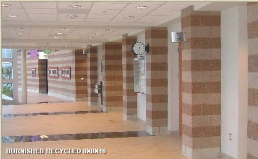
BURNISHED RECYCLED 8X8X16

Grand Blanc Cement Products commitment to environmental quality has never been stronger. We offer a variety of Burnished Masonry units manufactured with recycled content to meet or exceed the demands of LEED® point criteria. With many colors and shapes to choose from, the flexibility to design "Green" building projects is exceptional. Regionally extracted, processed and manufactured materials provide consumers with a minimum of 40% pre-consumer recycled content by weight.