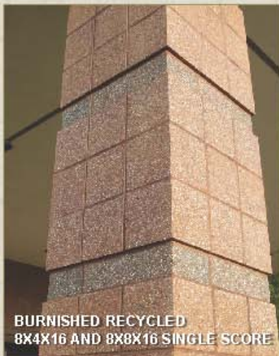
BURNISHED RECYCLED 8X4X16 AND 8X8X16 SINGLE SCORE

Burnished Recycled Masonry Units are manufactured with the same high quality standards that are found in Burnished Units. Interior and exterior applications are mold and mildew resistant and easy to clean. Factory applied acrylic or water-based sealants emphasize the natural beauty of the exposed aggregates color. Water-based sealants also provide LEED® points by emitting low VOC's and reducing air-born contaminants.